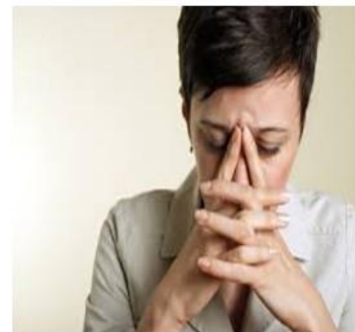
Stressed and Depressed Dementia Caregiver