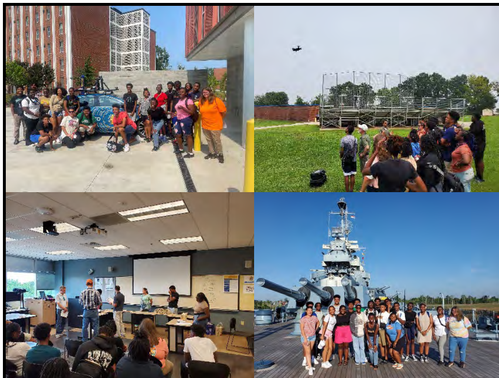
Figure 4: 2023 Summer High School Transportation Institute

management. They also engaged in activities such as a bridge building competition; tours to locations such as the Greensboro Transit Authority, Greensboro Distribution Center, Beta Technology Flight Simulator, Port of Wilmington, and NC Maritime Museum; and they learned about the Aggie Autonomous Auto project and drones (Figure 4). Their group project involved the creation of a self-sustaining report network for pedestrian barriers, which involved pitching their research-based idea for a citizen science sidewalk survey.