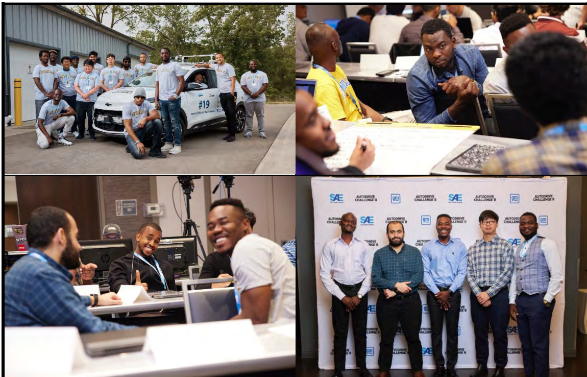
Figure 5: AutoDrive project team members

Additionally, approximately 80 ASETTS students earned points towards at least one of the five transportation badges during the 2022-23 academic year: Transportation Awareness and Engagement Badge: 37 activity completions, Transportation Core Skills Badge: 149 activity