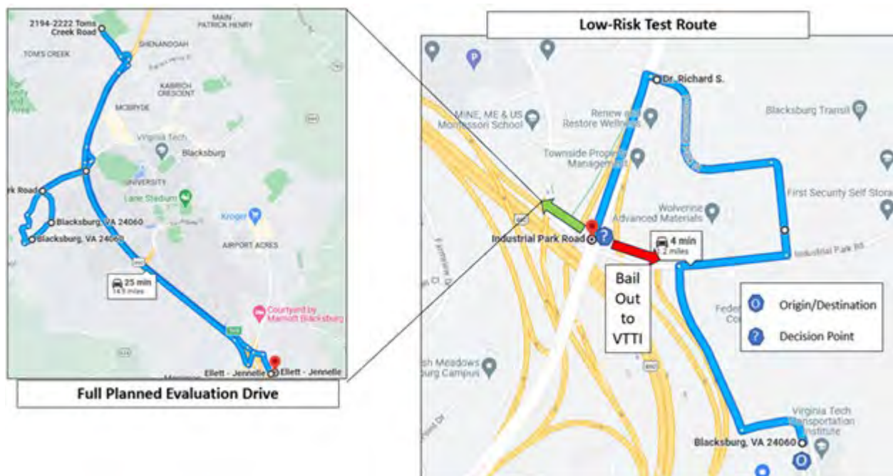
Figure 1: Route used for three researcher-supervised drives

In continuation of the original project, the ROAD TRIP team introduced adjustments to the original protocol based on the experiences of the first four participants. These adjustments were aimed at optimizing the benefits of the program to study participants. Six participants completed the study under the adjusted protocol. The team received supplemental funding to extend the project [ROAD TRIP 2.0 – Transforming the Mobility Landscape for Aging America (ROAD TRIP 2) ] and continued their efforts to expand the footprint of the program. The team replaced the VTTI DAS with a series of three researcher-supervised drives before and after the driving consultation meeting and enrolled 5 additional participants under this protocol. Figure 1 displays the route used for the three researcher-supervised drives taken over the course of the 8-week participation period. The first drive precedes the consultation, the second is taken one week following the consultation, and the third is taken three weeks post-consultation to assess long-term effectiveness of the intervention.