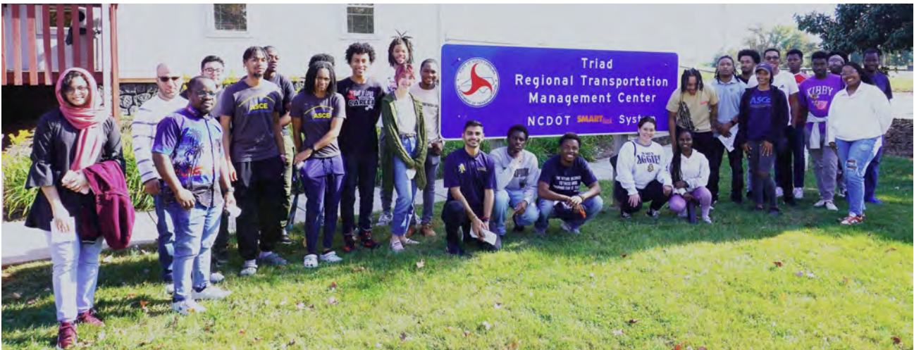
N.C. A&T students at the N.C Department of Transportation's Greensboro Traffic Management Center.