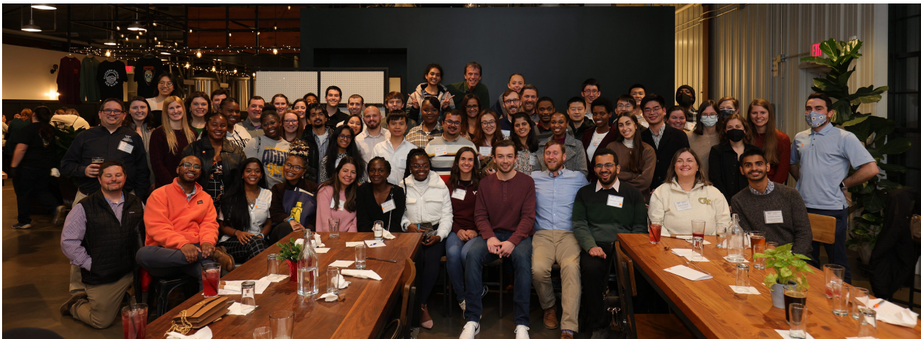
Attendees of the Southern District ITE Student Leadership Summit at Virginia Tech in February 2022.

Visit CATM's Education and Workforce Development Activities page to learn more today!