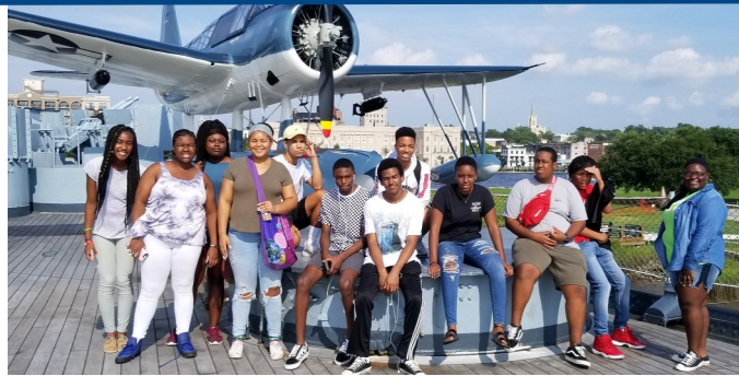
The 2018 STI class at the Battleship North Carolina in Wilmington, North Carolina.